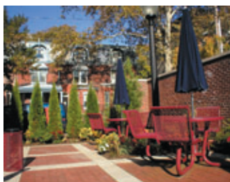
OUTDOOR LIVING SPACE

Marge says she finds it a very comfortable place where you can feel safe and secure, she says as she looks at pictures of her grandchildren. "The building is kept immaculate. I can't imagine a place - anywhere - as nice to live as the Village," she smiles playfully, and winks. "I think I'll stay."