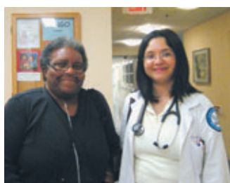
St. FRANCIS MEDICAL SUITE